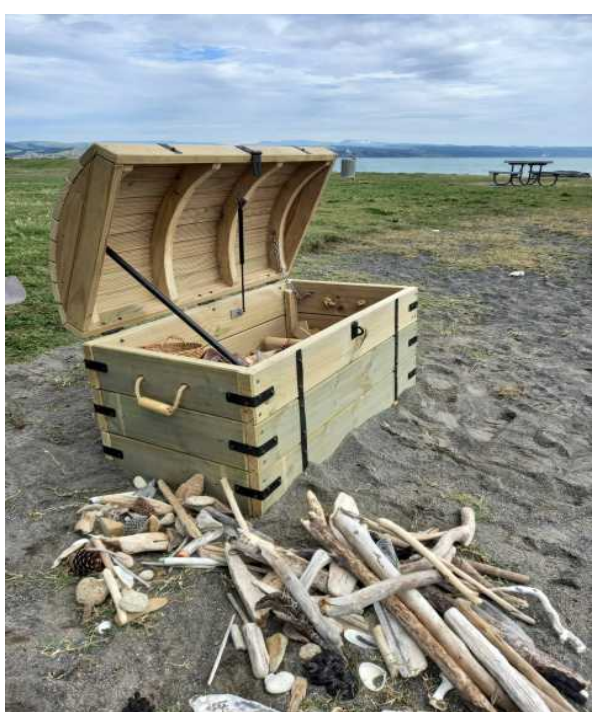
Look what washed up on the Ahuriri beach.