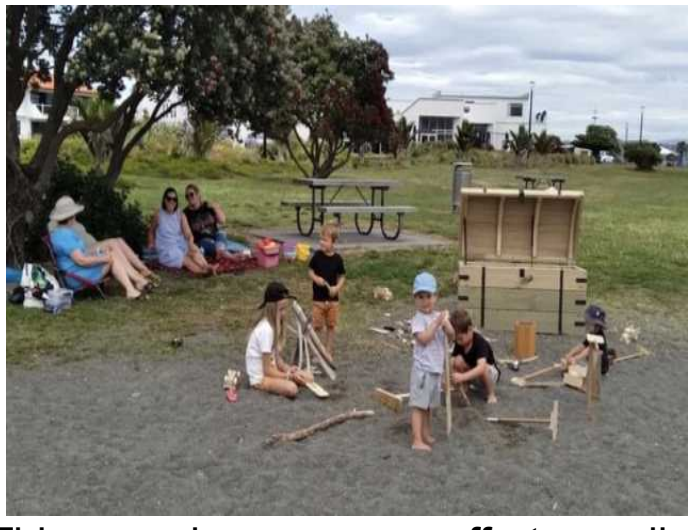
This makes our efforts all worthwhile. Happy children playing with the treasure found in the chest. I wonder where it came from?