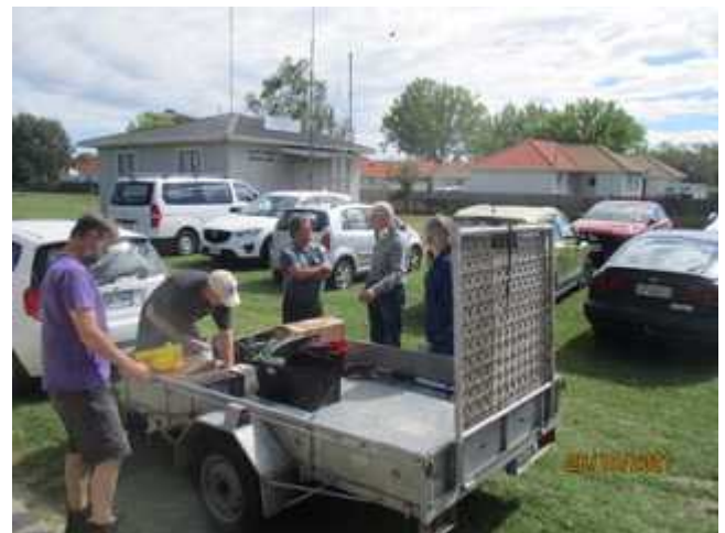
Loading the trailer with items for our garage sale which will be held on Saturday December 4 th . Our storage shed at Whitmore park is filling up with things for the sale. We will need plenty of hands on deck on the 4 th to set up and man the sales tables. If the sale we had earlier this year is anything to go by, it will be a lot of fun and profitable as well.