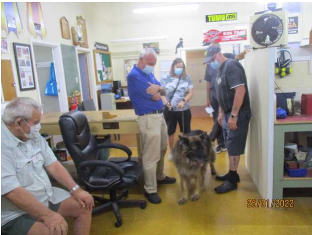
A visitor. Is it a wolf? No it's a Fox!