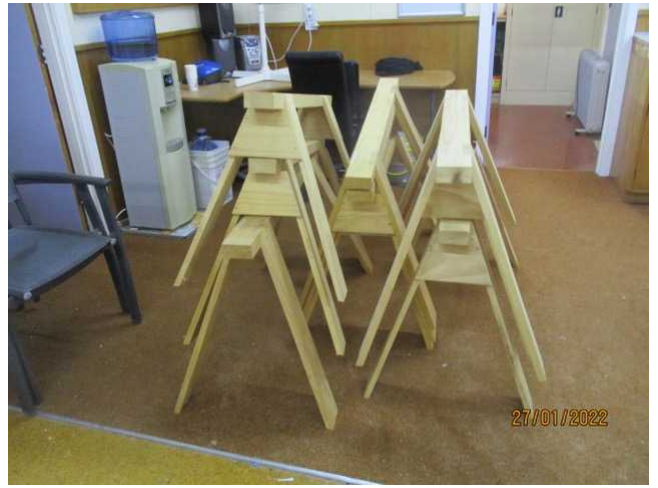
Trestles made by the inmates at the H.B. prison. These trestles were given to us. Some will be for our own use with the rest going into our next garage sale.